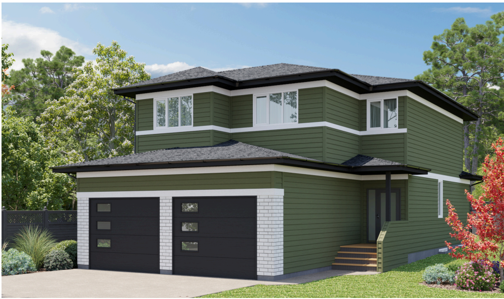
Image is a rendering only, exterior style, actual square footage, features, and details may vary.